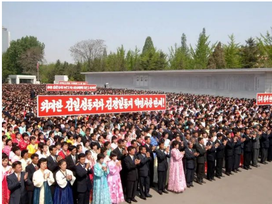
A picture release by KCNA on 02 May 2014 shows North Korean workers attend a rally in Pyongyang, to celebrate the May Day holiday.

On 1 May every year, thousands of North Koreans celebrate International Workers Day. Pyongyang is awash in a sea of flags as waves of workers, bouquets in hand, line up in front of the statues of Kim Il-sung and Kim Jong-il on Mansudae Hill to pay their respects. The Rodong Sinmun, official mouthpiece of the Worker's Party, tells of workers across the country participating in sports matches and picnics organised by their state employer. It is 1 May, celebrated in North Korea as International Worker's Day.